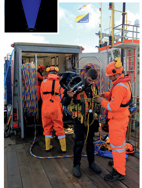
| Divers in Portsmouth